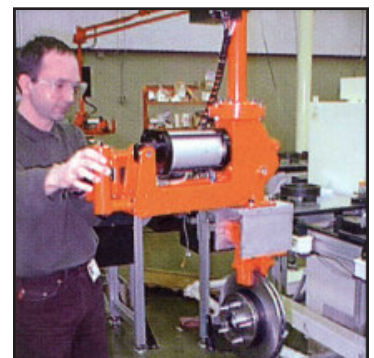
Tool manipulates disk brake hubs through the various manufacturing and machining operations.

Positech ™ Corporation A Division of American Handling Systems, Inc.