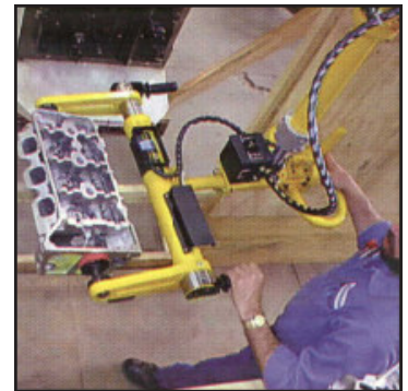
Tool positions engine heads for placement into a 5-axis machining center.