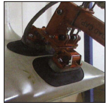
Vacuum tool handles picture tube funnels during the manufacturing process.

** Vertical lift varies according to lift-arm length