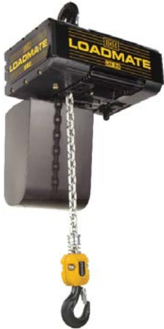
Fixed Top Hook