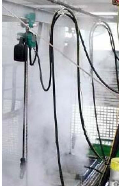
Profi Series in Tank Cleaning Facility