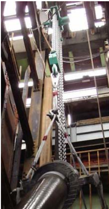
High Capacity 37.5 Ton Pipe Section Handling