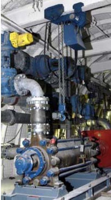
Low Headroom Pump Station