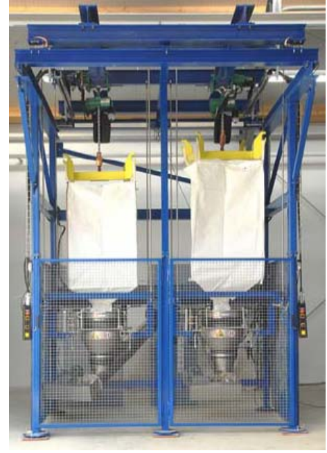
Twin BBH Systems Super-Sack Handling