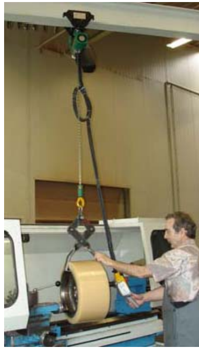
Mini Hoist Loading a Truck Wheel into a Lathe